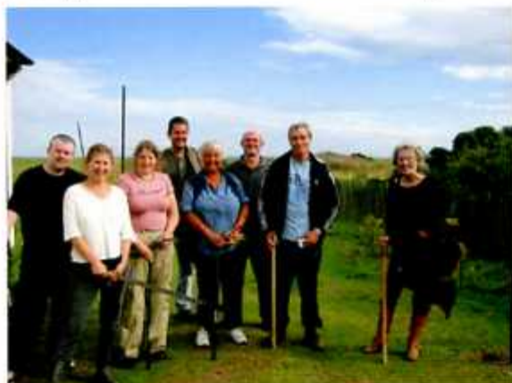
SHARK bracken bashers

We had two groups of volunteers helping with the bracken bashing in August. SNH colleagues from our main Area office in Aberdeen, and from Forvie National Nature Reserve spent a day using brushcutters and other machinery on the flatter areas. We were also lucky to have band of willing helpers from the Johnshaven based Safe Habitats Alliance for Rural Kincardineshire (SHARK) group who tackled some of the more difficult to reach areas with hand tools. The eight SHARK volunteers really made an impact on areas that can't be accessed with machinery. It is hoped that all the effort will be worth it with an even more spectacular show of flowers come the spring. We plan to organise another couple of bracken bashing events this summer to continue the good work.